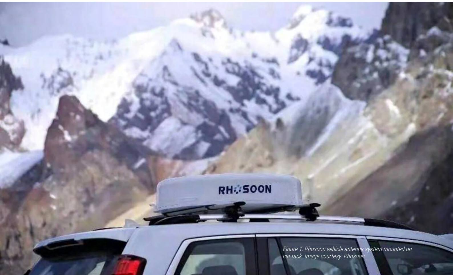
Figure 1: Rhosoon vehicle antenna system mounted on car rack.