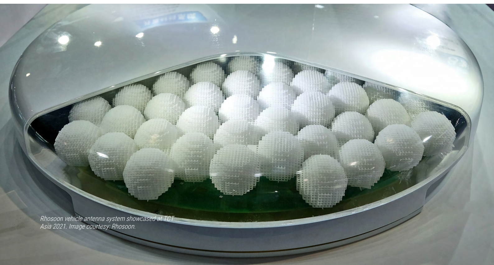
Rhosoon vehicle antenna system showcased at TCT Asia 2021.

As of today, Rhosoon's novel 3D printed vehicle antennas solution has successfully offered affordable, high performance communication service for remote areas with weak network coverage, and provides reliable support for emergency operations under extreme conditions. "With the rapid development of the antennas and 3D printing technology, we envision a more compact communication device as small as a notebook, and with a true economy of cost to enable wide scale adoption of satellite-terrestrial communication integration in the near future." Says Rhosoon.